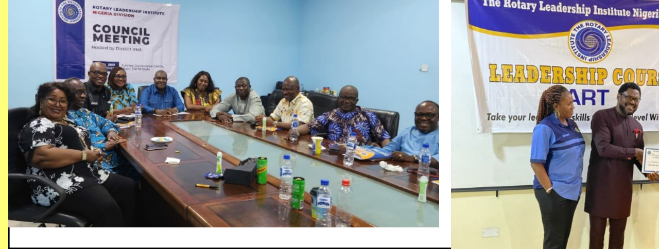
The Rotary Leadership Institute is not an official training program of Rotary International.