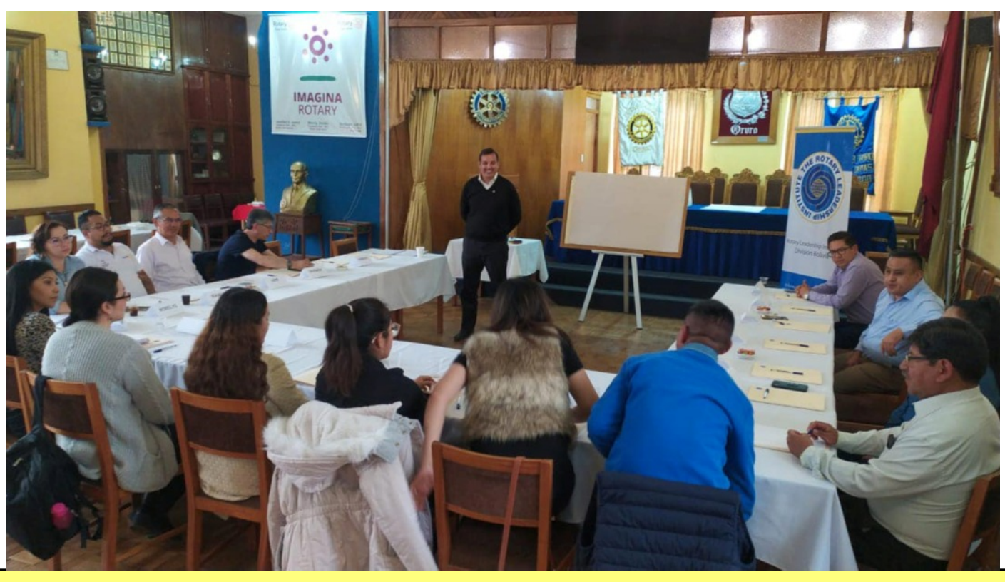
The Rotary Leadership Institute is not an official training program of Rotary International.