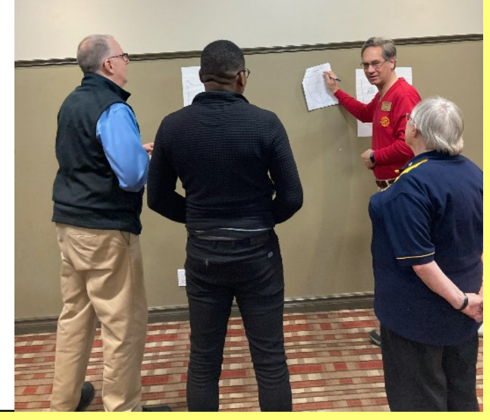
The Rotary Leadership Institute is not an official training program of Rotary International.